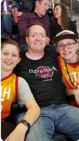
Me and my boys at the Jazz game. It was always a blast catching up with you before the games.